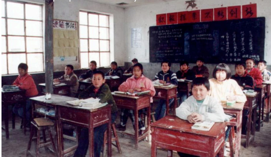
A Windows Project sponsored elementary school